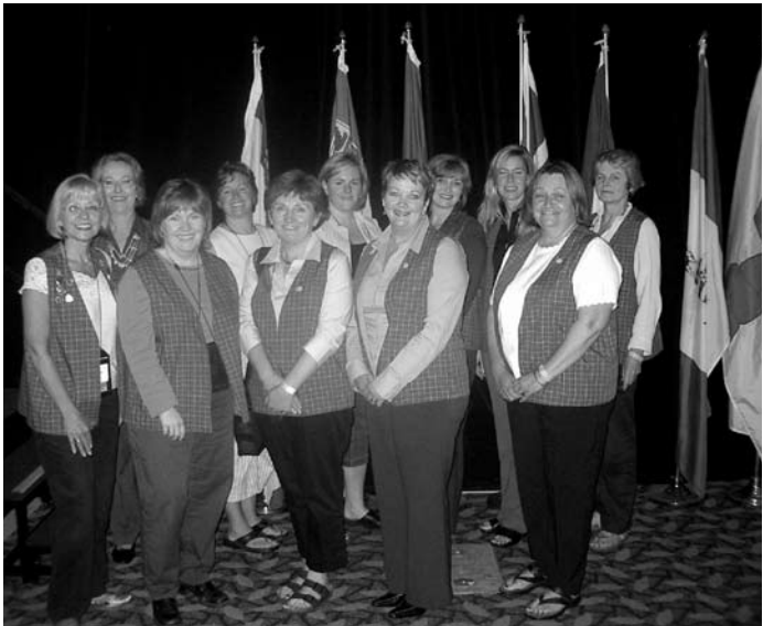
Halifax Planning Committee.