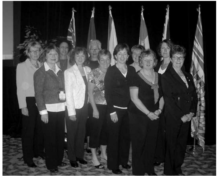
2007 CSGNA Scholarship Recipients.